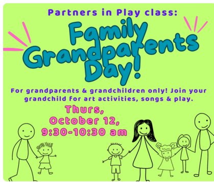
Family Grandparents Day