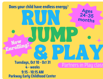
Run, Jump & Play